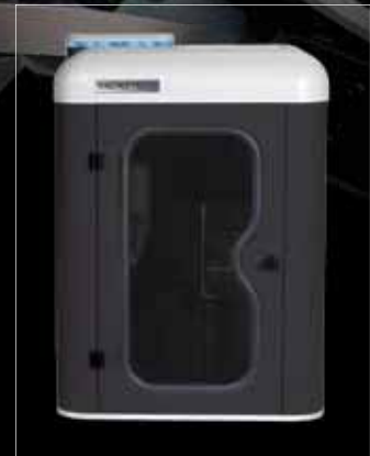
Optional Locking Security Cover