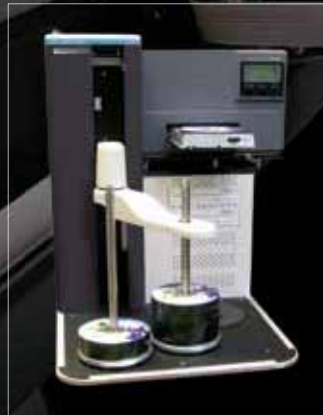
High Capacity Mixed Media CD/DVD Production Microtech's Xpress XL

Xpress XE is designed for continuous CD and DVD publishing. It is the perfect automated system for creating discs with unique content in a networked environment.